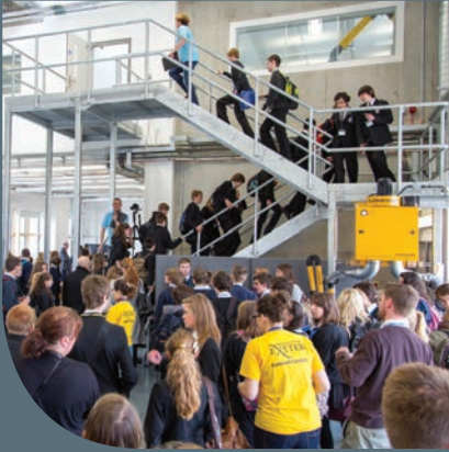
Children from Cornish schools at the ESI's opening, April 2013.