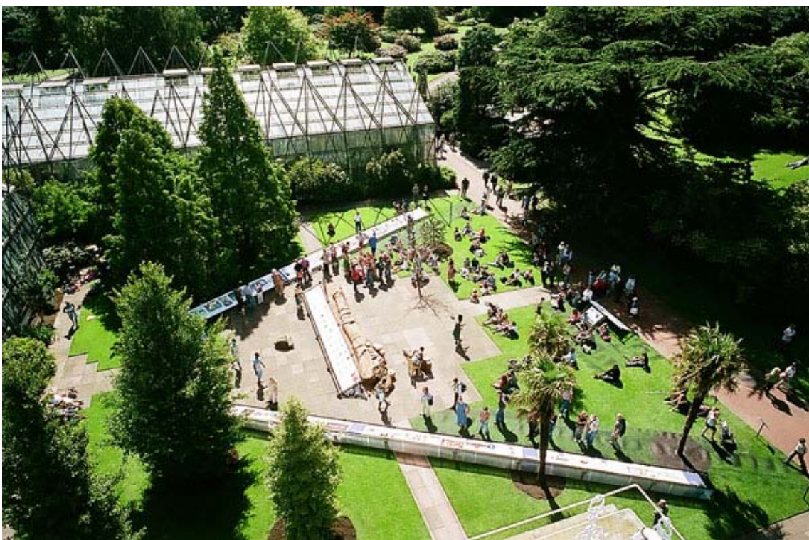
Hard Rain at the Royal Botanic Garden, Edinburgh