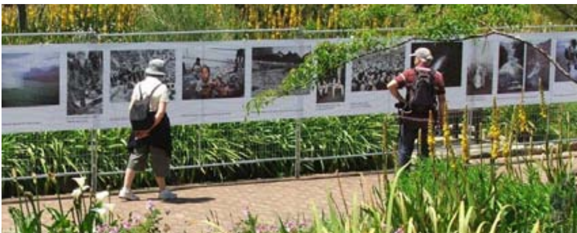
Kirstenbosch National Botanical Garden, Cape Town