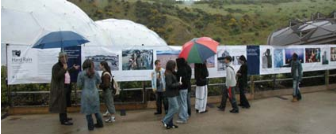
Eden Project, Cornwall

Forthcoming venues will take Hard Rain to Easter Island and the Arctic Circle. A documentary film is planned.