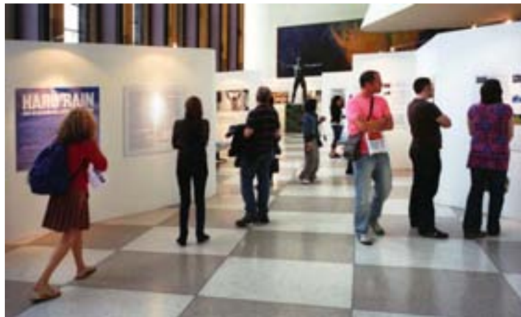
United Nations Building, New York