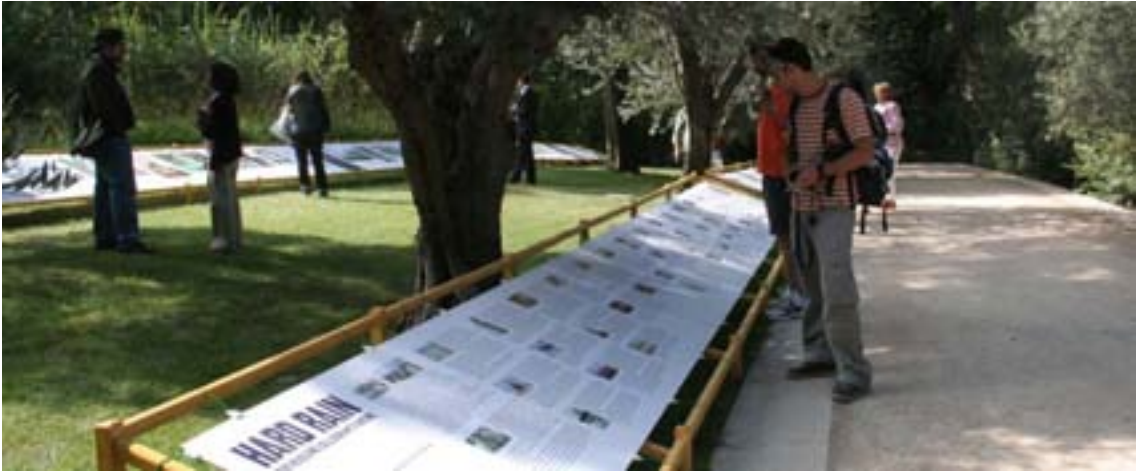
Royal Botanical Garden, Madrid