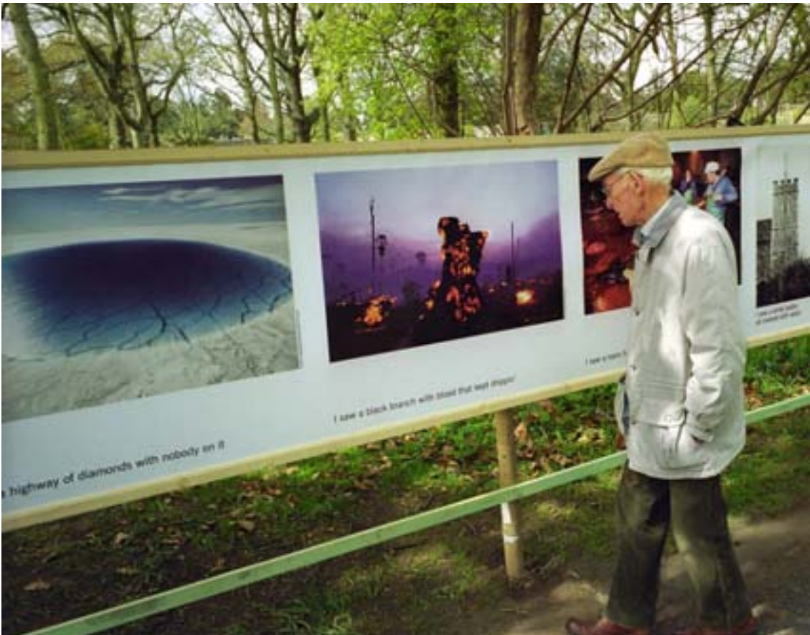
National Botanic Gardens, Dublin