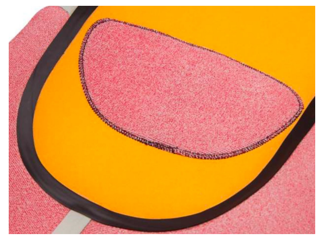
Wetsuit linings from recycled material

https://www.yulex.com/post/rubber-chronicle-19co2e-emissions-of-natural-rubber-neoprenegeoprene-and-sbr