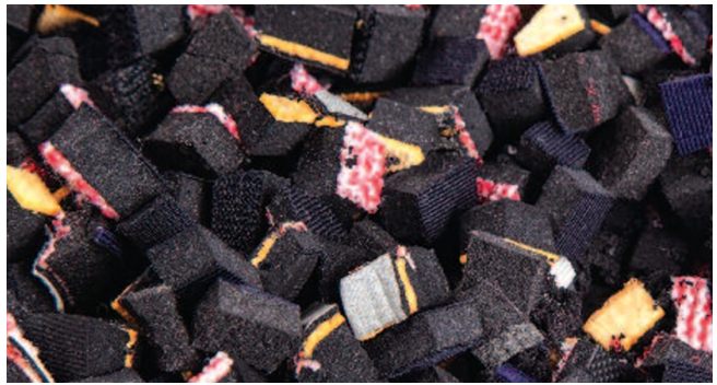
Shredded wetsuits for recycling trials

Recycling and end-of-life options - Recycling of wetsuits into material that can be used for making new wetsuits is difficult because of the multiple materials and the cross linking in the polymer chains, which prevents the rubber foam being remelted into the same material. Various processes of devulcanization can be used to remove cross linking and incorporate some end of life material back into a mix of virgin material to make new rubber products. Other options include pyrolysis to produce carbon black from the rubber products, or turning it into a rubber crumb, which can be mixed with other materials for use in road surfaces, playgrounds etc, or chemical recycling to try and get the material back to its original molecular building blocks.