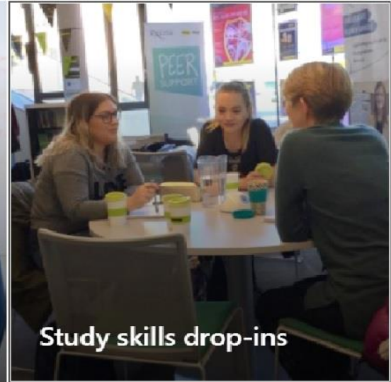
Study skills drop-ins