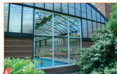
4 Indoor Swimming Pool

There are two sports halls, (one fully kitted out for 5-a-side football), the gym, equipped with cardio-vascular equipment, and a heated indoor swimming pool. Students studying on this site also regularly use the facilities on the Streatham Campus.