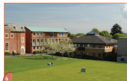
6 Peninsula College of Medicine and Dentistry

Children's Exercise and Research Centre – www.exeter.ac.uk/cherc