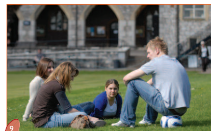
9 The Quad