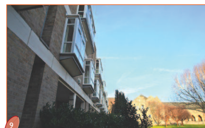
9 South Cloisters