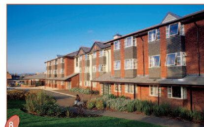
8 College House