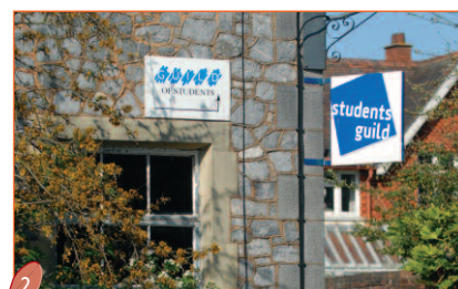
2 Students' Guild

Baring Court is used for various purposes. The ground floor is used by the Graduate School of Education to simulate the classroom experience and also houses the internationally renowned Children's Health and Exercise Research Centre. The centre is devoted to the study of the exercising child and aims to initiate research in paediatric exercise science and disseminate the findings. The top two floors have small lecture theatres and seminar rooms.