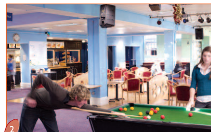
2 Cross Keys Bar