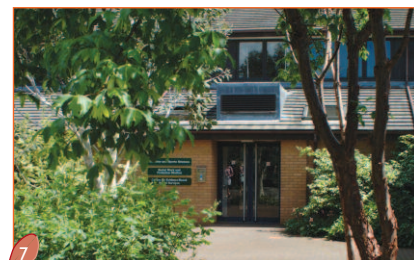
7 Richard's Building