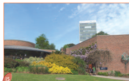
15 Peter Chalk Centre