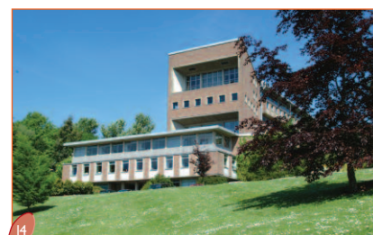
14 The Laver Building