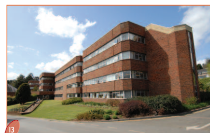
13 Amory Building