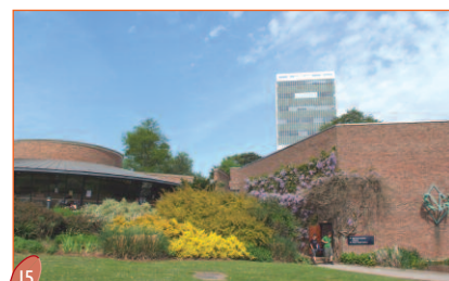
15 Peter Chalk Centre