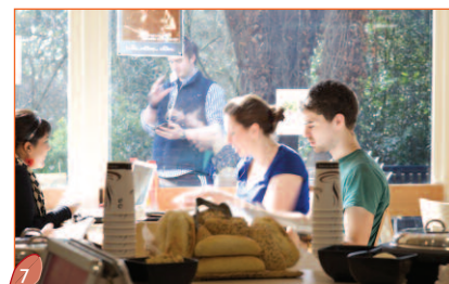
7 Devonshire House

At the end of the path go up the steps in front of you into Cornwall House 32. Turn right once you are through the sets of double doors and you will be standing in the main room of Cornwall House, The Lemon Grove. This is one of the most popular venues in Exeter for live music and club nights. Smaller events happen throughout the year, including an open mic night, every Wednesday, hosted by XpressionFM, the campus radio station.