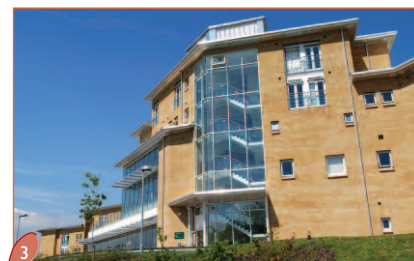
3 Holland Hall

3 From Holland and Mardon Halls, walk back to the road that leads down the hill. Cross over and follow the path alongside the building, keeping the wall to your left. You will shortly reach a courtyard on your left. The buildings here are the Careers and Employment Service and the Student Health Centre 15. The Careers Service provides information and guidance for Exeter students as well as organising many visits from large companies looking to recruit Exeter graduates.