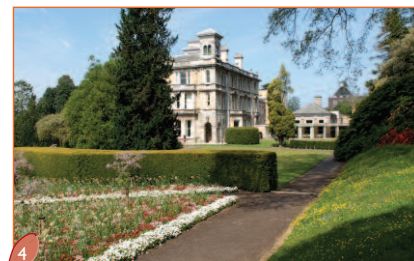
4 Reed Hall

7 Devonshire House 2 is the main Students' Guild building. It houses, among other things, the Ram Bar, several catering outlets, the Students' Guild shop, The Works (job shop), the Student Advice Unit and Exelets. The Students' Guild has