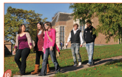
10 Streatham Campus