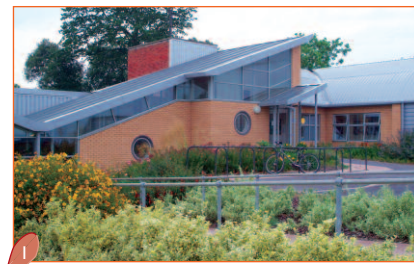
1 Sports Park

1 Start the tour at the Sports Park 60. If you'd like to take a tour of the Sports Park there is a self-guided tour leaflet that you can pick up in reception. Staff will be very happy to answer any specific queries that you may have. The Sports Hall is used for archery, badminton, basketball, football, hockey, netball and volleyball. We also have indoor cricket and tennis centres. There are two exercise studios, a 90 station air-conditioned fitness studio and four squash courts. Outside there is a pathway that will lead you to the all-weather floodlit pitches and tennis courts.