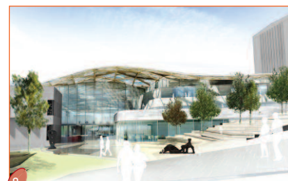
8 The Forum