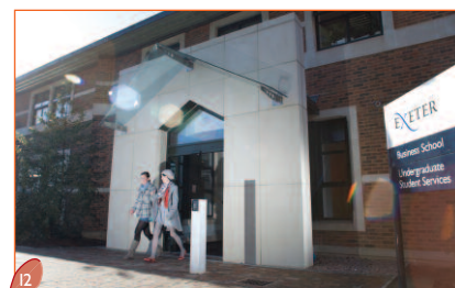
12 Business School

We hope you have enjoyed your visit – have a safe journey home!