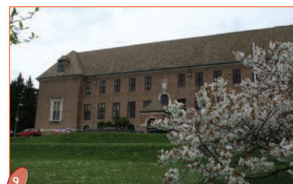
9 Washington Singer