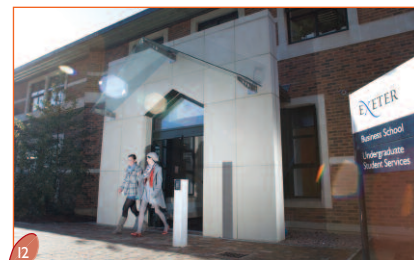
12 Business School

We hope you have enjoyed your visit – have a safe journey home!