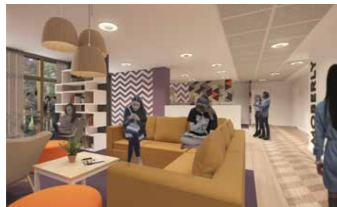
Moberly – Artist Impression.

You can find out more about East Park, Moberly, and Spreytonway on our website www.exeter.ac.uk/accommodation/residences/newresidences