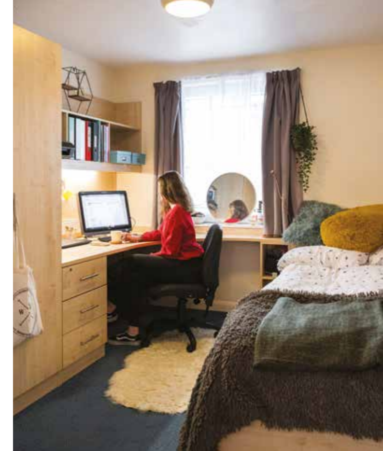
En-suite room, Lafrowda.

Each residence is a welcoming community with its own distinctive character, offering you a safe and secure environment in which you can socialise, study and relax. For further information including virtual tours of many of our residences please visit our website; www.exeter.ac.uk/accommodation/residences/virtualtours