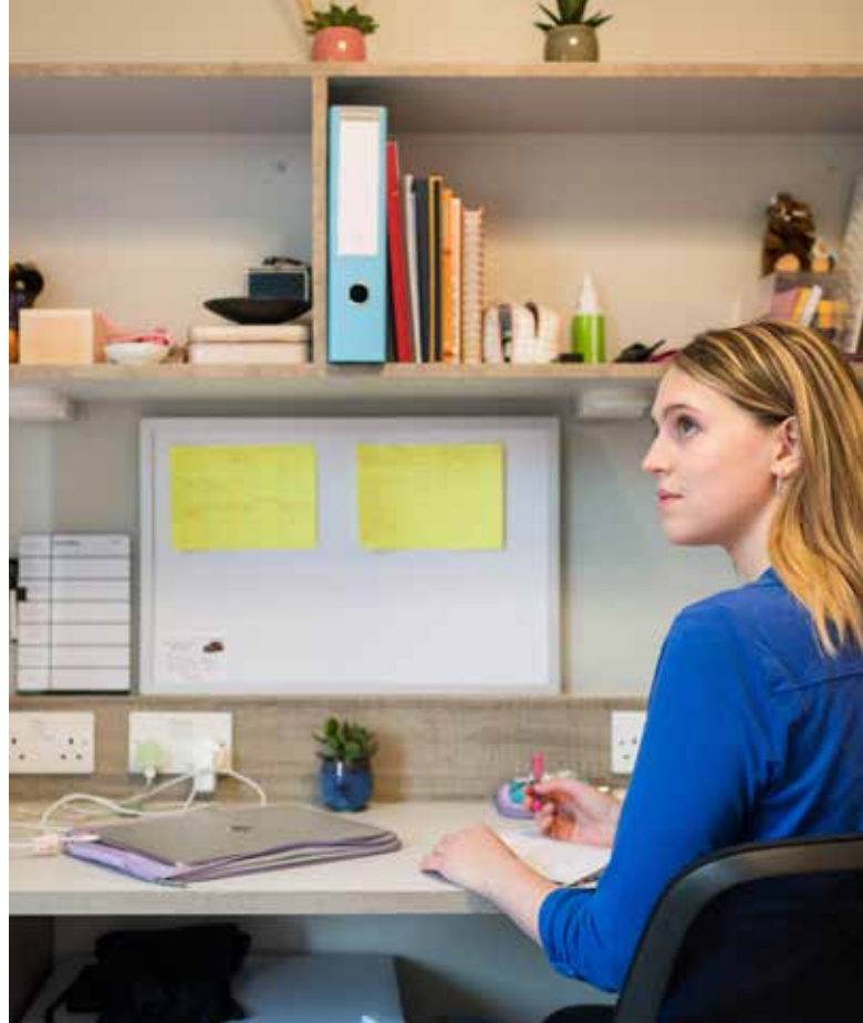
Ensuite room, East Park.

For further information, including virtual tours of many of our residences, please visit our website: exeter.ac.uk/accommodation/residences/virtualtours