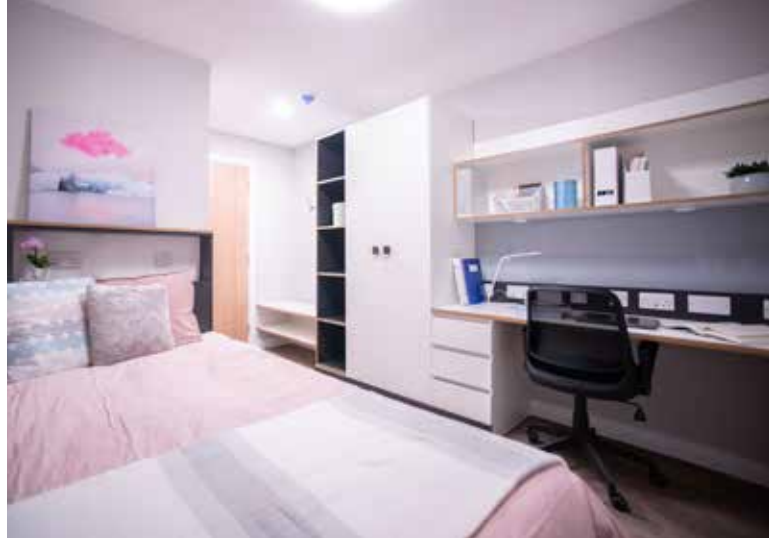
Standard room, Moberly

Depending on the volume of applications we receive, it may be necessary for us to source additional accommodation in the city, which may not previously have been advertised. In this situation we will ensure that full details are made available on our web pages ( exeter.ac.uk/accommodation/applying/accommodationguarantee )