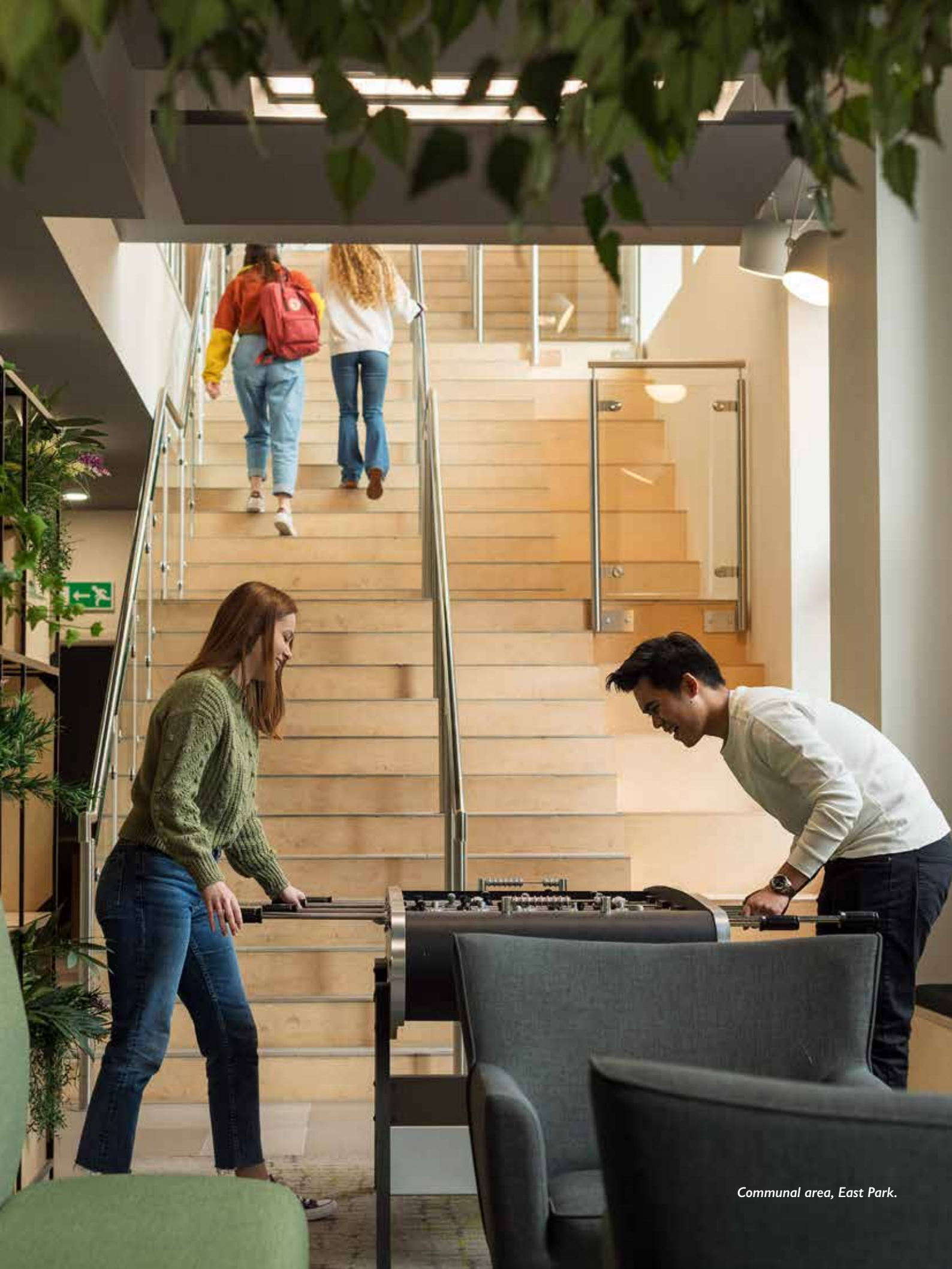
Communal area, East Park.