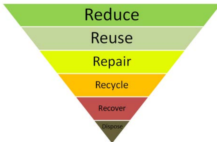
Figure 1: The Waste Hierarchy

Waste Hierarchy - the main principles behind the University's Waste and Resource Management Strategy are based on the well-established Waste Hierarchy. This has become a cornerstone of sustainable waste management practices, setting out the order in which waste management measures should be prioritised based on environmental impact.