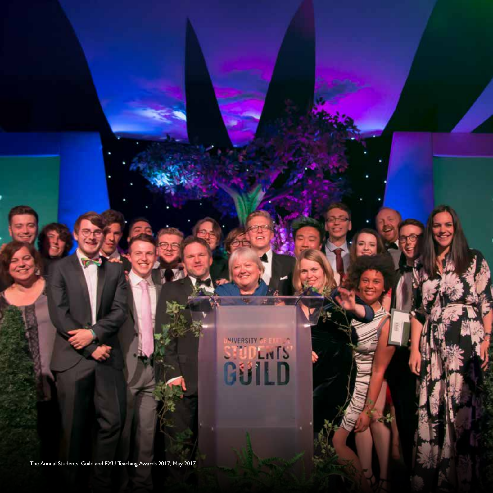
The Annual Students' Guild and FXU Teaching Awards 2017, May 2017