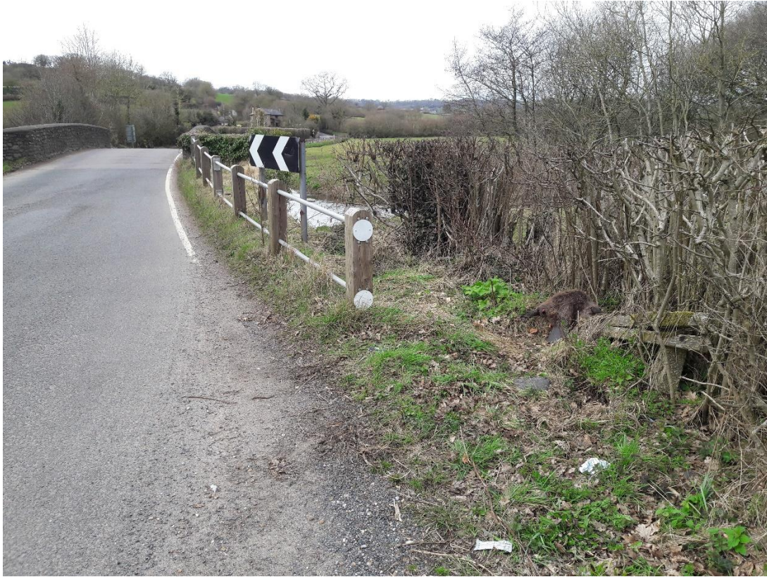
Picture 1. The beaver was found on the south side of Langford Bridge, North of Honiton. The beaver was located to the side of the road, in the hedge, and had been scavenged upon.

The post mortem followed a methodology provided by Roisin Campbell-Palmer (Campbell-Palmer & Rosell, 2013). The post mortem identified the beaver by locating and scanning the PIT tag. The beaver was a four-year-old female, born in the catchment in 2014. She was trapped and re-released at the start of the River Otter Beaver Trial in 2015. The beaver weighed 19Kg. The female was in very good condition and was pregnant at the time of death. Part of one foetus was recovered and further analysis may provide the age of the foetus.