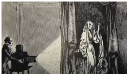
Robertson's use of rear projection, as depicted in Le Magasin Pitoresque, 1849