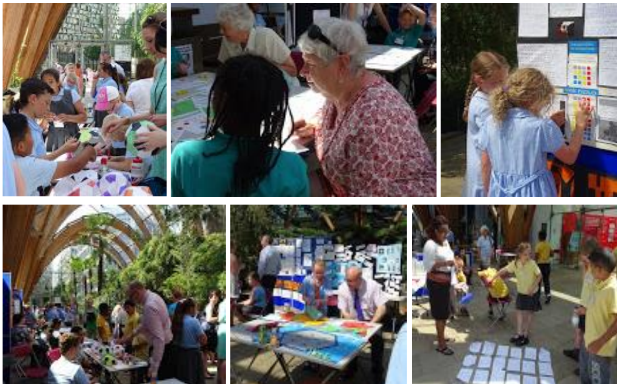
Figure 3: The MiMa exhibition in the Winter Gardens, Sheffield.

A distinctive feature of the MiMa project was that, throughout the laboratories, the teachers and children knew that they were preparing their objects and activities for public exhibition. Thus a fundamental aspect of the MiMa methodology was that children would display and explain their mathematics to others - their parents, other children and members of the general public. The physical models and activities produced in the project represented the concrete output of the children's mathematical thinking and acted as a supportive bridge to their reasoning and explanations. The reflection on their own learning and the mathematical strategies they had employed (which the process of explanation required) contributed to the metacognitive strength of the experience.