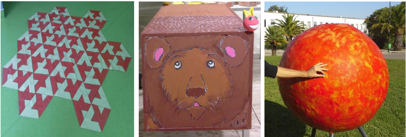
Figure 4: Children's work from Portugal.