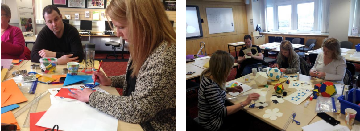
Figure 2: Participants in the MiMa teacher professional development workshops in Sheffield, UK.

A distinctive feature of the MiMa project was that, throughout the laboratories, the teachers and children knew that they were preparing their objects and activities for public exhibition. Thus a fundamental aspect of the MiMa methodology was that children would display and explain their mathematics to others - their parents, other children and members of the general public. The physical models and activities produced in the project represented the concrete output of the children's mathematical thinking and acted as a supportive bridge to their reasoning and explanations. The reflection on their own learning and the mathematical strategies they had employed (which the process of explanation required) contributed to the metacognitive strength of the experience.