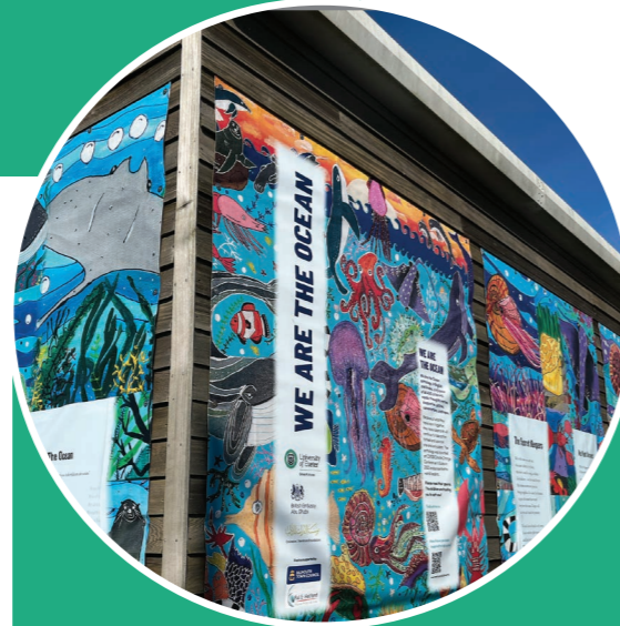
We Are The Ocean display in Falmouth.

Children from King Charles and St Just schools have taken part in the Schools Across the Ocean international learning and school twinning programme, with counterparts in the United Arab Emirates (UAE), which highlights our connection with the sea and the urgent need for action on climate change. The children, aged 9-12, co-created a piece of artwork and poetry called We Are The Ocean with writers, scientists and educators at the University of Exeter and the Met Office and academics in the UAE. The poems can be read alongside vibrant illustrations of marine life that have transformed Grove Place, near the National Maritime Museum in Falmouth, into an open-air exhibition.