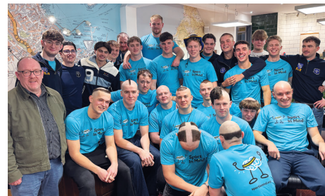
CSM Rugby sport 'awful haircuts' – thanks to the team at The Town Barber, Falmouth.