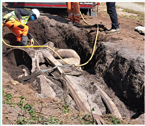
The two-tonne fin whale skull is uncovered.