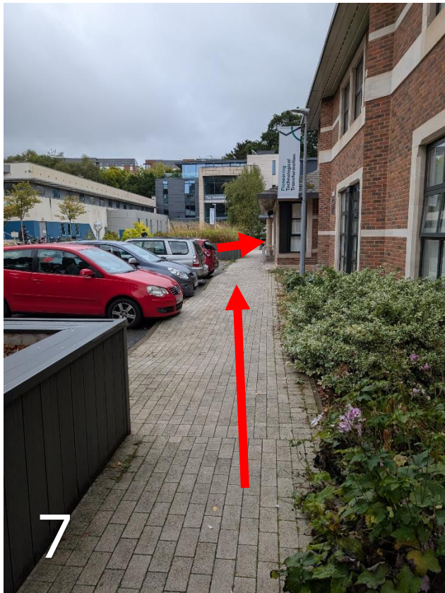
Photo 7 - 10: (7) Continue straight on, as if walking to the Building One front entrance, but turn right at the first available turning after the parking bays (8). The Creative Quadrant will then be directly ahead of you (9).