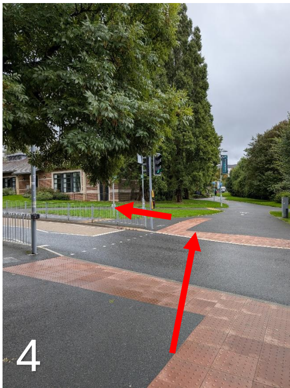
Photo 4 - 6: (4) Cross the road, and turn left, (5) then walk straight on until you reach the right hand turn towards the Business School (6).