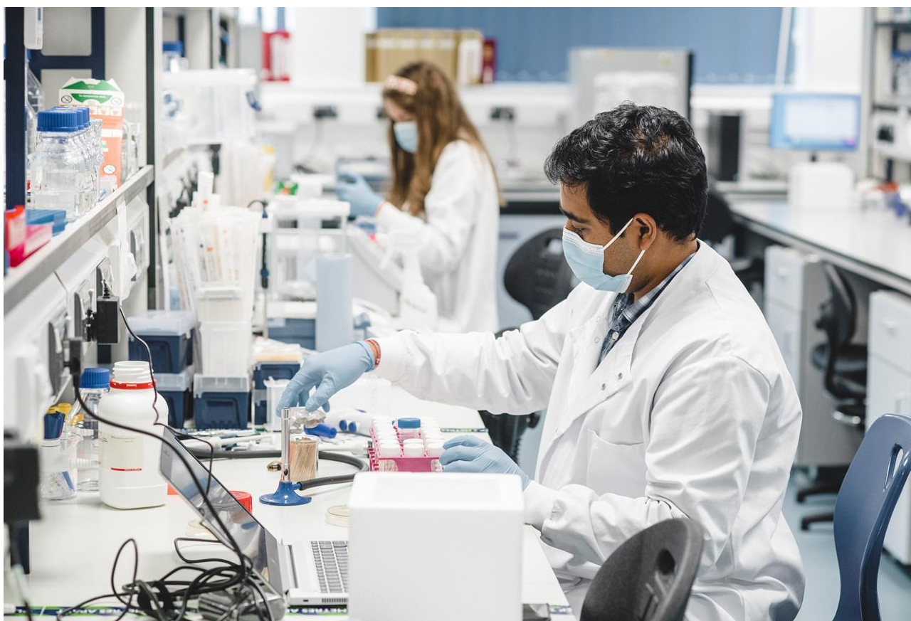
Image: Researchers in the MRC Centre for Medical Mycology

More information about the cross-disciplinary themes, the event and eligibility for attending will be sent to GW4 AMR Alliance members shortly.