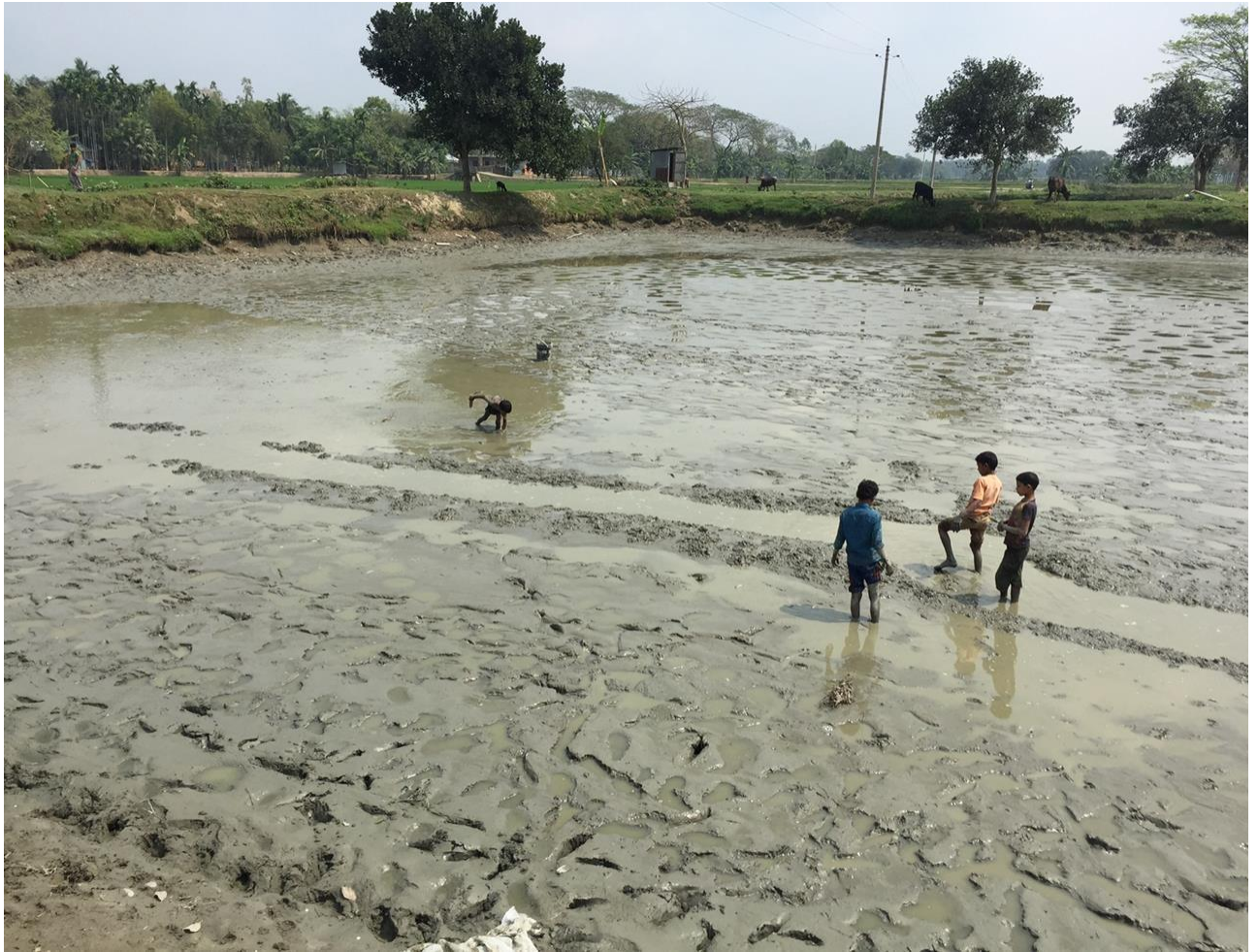
Image: Aquaculture in Bangladesh